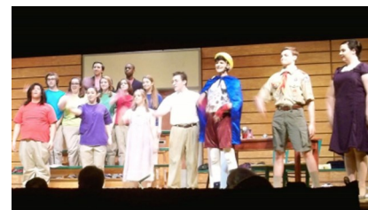
Mainstage Ensemble Performance

HHS Key Club World Languages Honor Society Web Design Club ENOUGH Project European Travel Gender Equality Club Girl's Golf Bermuda Workshop Video Yearbook DECA Hamden Ambassadors Theater - Mainstage Ensemble Human Relations Club Italian Club Latin Club Marching Band-Color Guard Mock Trial Team American Immersion Club Young Educators Society Writer's Club