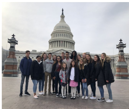
Award Winning DECA Program

National Honor Society Audio Technology P.A.W.S Ping Pong Etymology Club Project 7 Robotics Team Dance Team Debate Team Ultimate Frisbee Club Bowling Club Reptile Club Science Club Dark Nights Astronomy After Prom Committee Asian Club World Pride Club Ballroom Dancing Chamber Choir Black/Hispanic SU Health Professions Club Best Buddies Bridge Builders Club Unified Friends Club