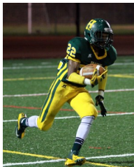
13 Time State Champion Dance Team

Hockey Basketball Indoor Track Cheerleading Dance Team Boys Swimming Girls Gymnastics