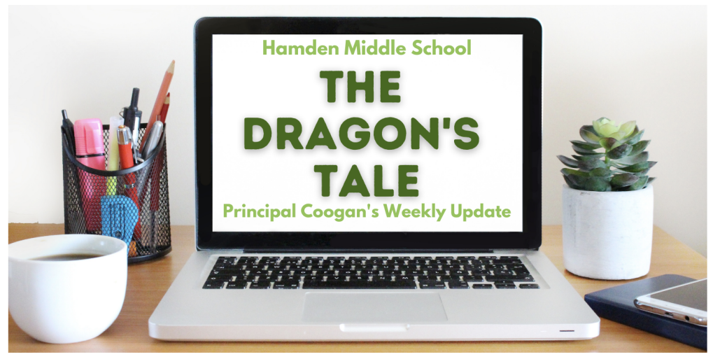
Monday, September 27, 2021, Issue 5